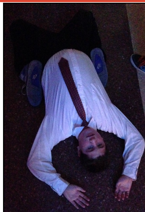
How low can you go?