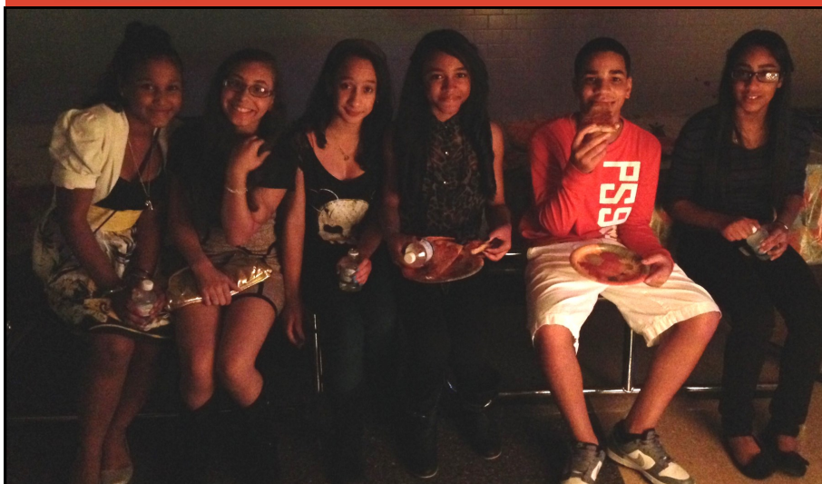
CHEESE.....Pizza that is!