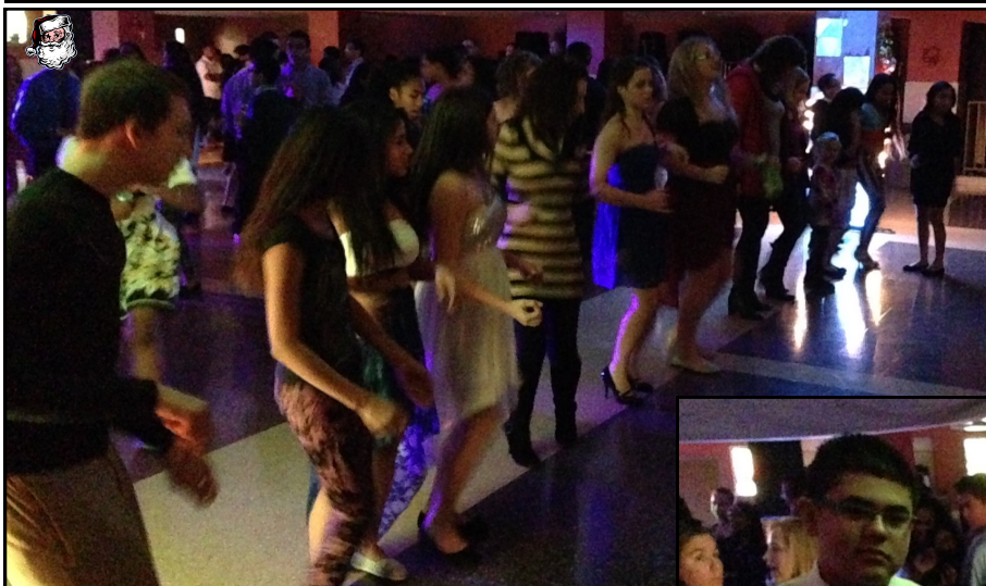
Below: Students and teachers dance to "The Cupid Shuffle."

Below: Some HMS students take a moment to pose for a photo at the Harvest Dance given by student council on November 15, 2013.